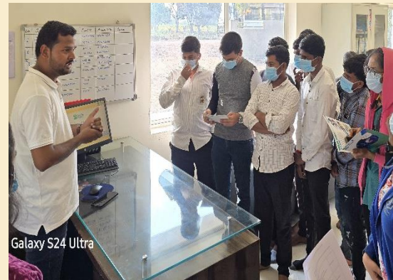
Global Bioresarch Solutions Pvt Ltd