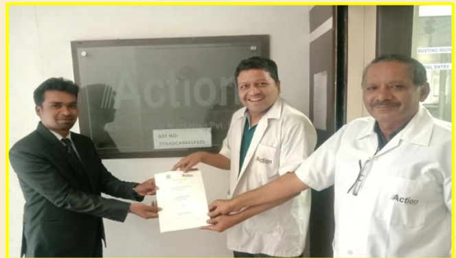
Action Medical Marketing Pvt Ltd